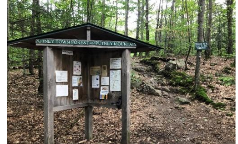
PUTNEY MOUNTAIN TRAILHEAD

New trails designed to meet the needs of various recreation users are being created, in large part by municipalities and non-profit groups. Examples of this include the Putney Mountain Association's preservation and trail development work in Putney, Dummerston, and Brookline and the Windmill Hill Pinnacle Association's work in Westminster, Brookline, Athens, and Grafton.