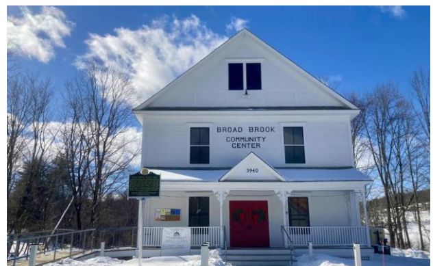
BROAD BROOK COMMUNITY CENTER, GUILFORD CENTER

Historic structures and sites are an integral part of the Windham Region's character and quality of life. They serve as a link to the past and through preservation and rehab efforts can help strengthen the local economy by promoting investment in other properties and tourism. It is in the public interest to preserve and enhance these historic resources. One way this is done is through support of local historic societies in the region, and collaborating with these societies on town projects when it is appropriate. There is also an