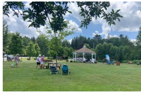
SUMMER CONCERT AT DOVER PARK

The Town of Dover hosts an annual Summer Concert Series at the Dover Park in West Dover. These events are funded entirely from the Local Option Meals and Rooms Tax the Town collects. Concerts are offered on Sunday afternoons and Wednesday evenings throughout the summer months.